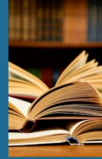
Reading and Writing Programs