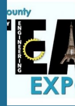
STEAM Expo 2020