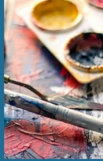
Visual Arts & Media Arts